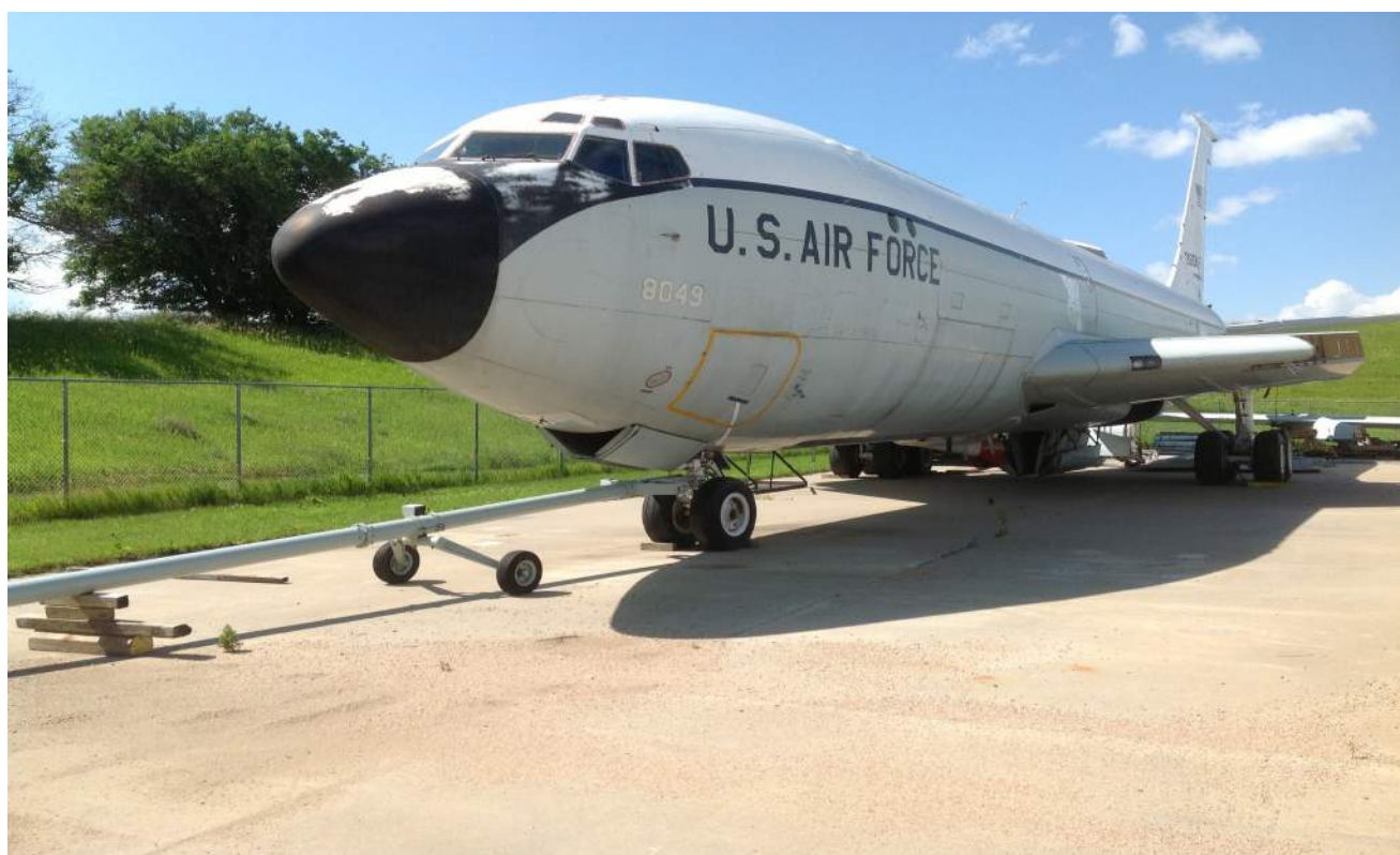
EC-135C, 63-8049 at Strategic Air & Space Museum