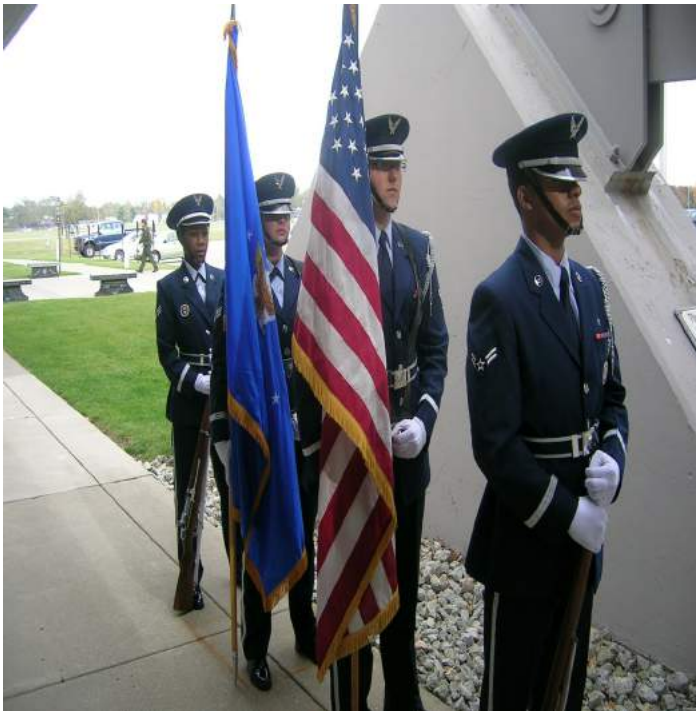
Wright-Patterson AFB Honor Guard

To all of these individuals, we extend a very well-deserved THANK YOU! "