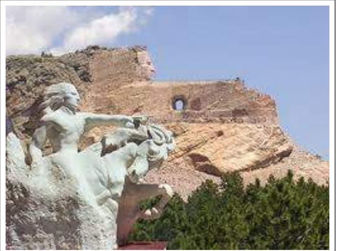
Crazy Horse Memorial