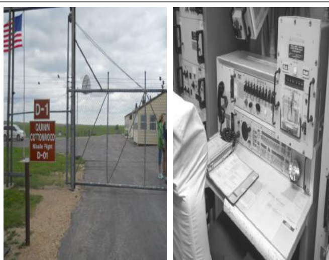
Delta-01 Launch Control Center, S.D.