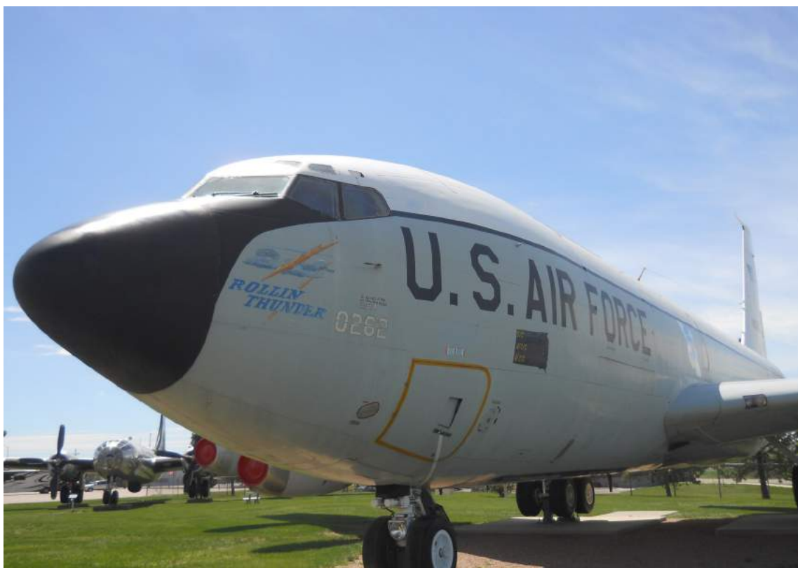
EC-135A No. 61-0262 at South Dakota Air & Space Museum - Ellsworth AFB, SD R. Minton