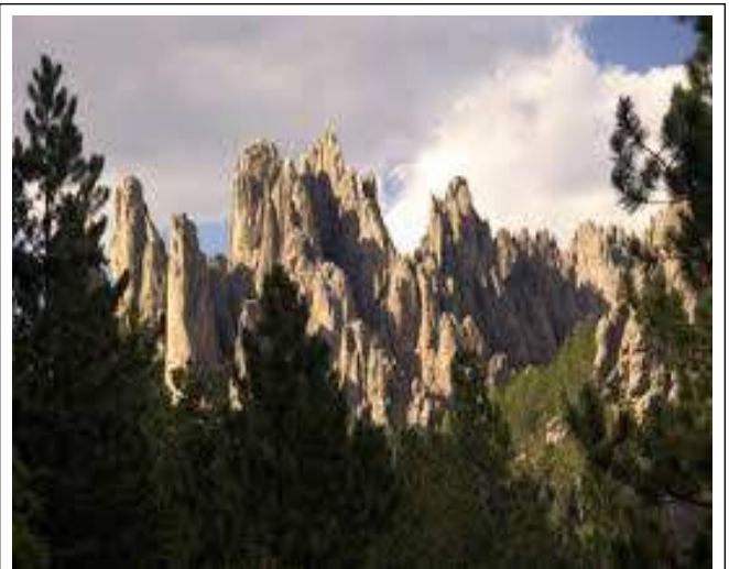
Custer State Park