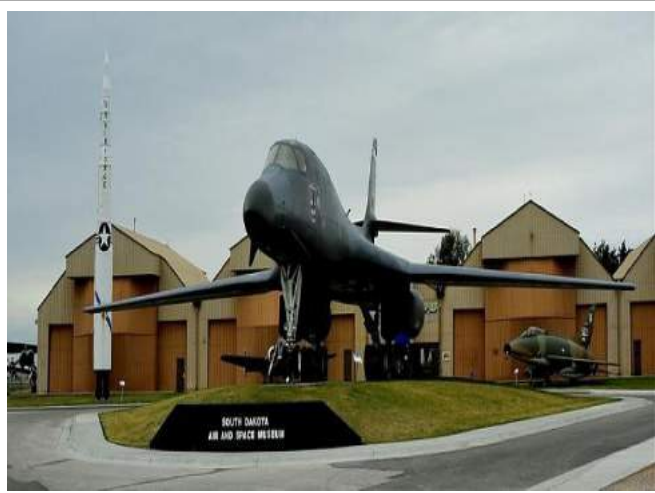
South Dakota Air & Space Museum